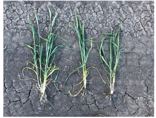
L-R,LRPB Flanker, LRPB Lancer, LRPB Stealth. Tullooona Early Season NVT Trial 2019

LRPB Stealth has been shown to hold 1-2 days longer to head emergence than Lancer in the warmer Northern environments and quicken itself in the cooler southern environments. This indicates a stronger vernalization requirement than its Lancer parent.