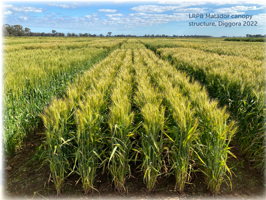
LRPB Matador canopy structure, Diggora 2022

LRPB Matador, mid spring, high yielding Scepter type with improved canopy and disease resistance