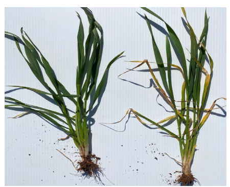
LRPR Major has improved Septoria resistance combined with decreased physiolgical yellowing over the Beckom parent

Resistance ratings: VS=Very Susceptible, S=Susceptible MS=Moderately Susceptible, MR=Moderately Resistant R = Resistant. Tol Rating - T=Tolerant, MT=Moderately Tolerant MI=Moderately Intolerant, I=Intolerant, VI=Very Intolerant. Varieties with * indicate breeder rating. Data sourced via NVT (www.nvt.grdc.com.au) and LRPB Disease Screening Results Feb 2023. p=Preliminary Data Based on limited data set